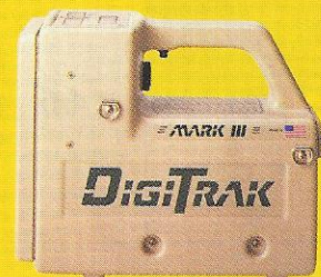
DigiTrak Mark III Receiver

To learn how DigiTrak can make your jobs go smoother, faster and easier, call 1-800-288-3610 or contact any dealer.