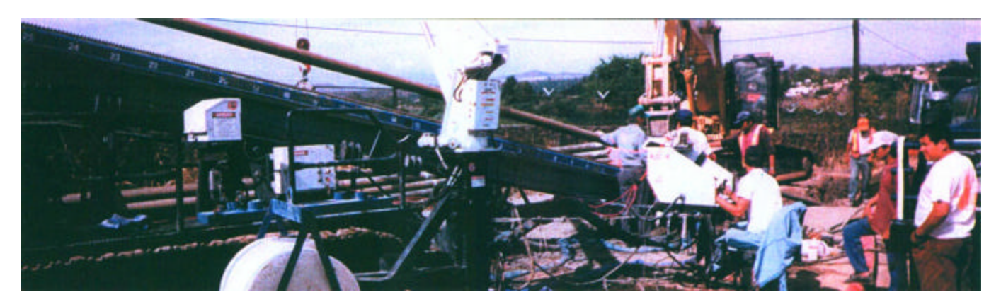
As Dynamic Cable's attempts on the crossing mounted, it became more an area event with spectators gathering round to witness the "battle with the devil."