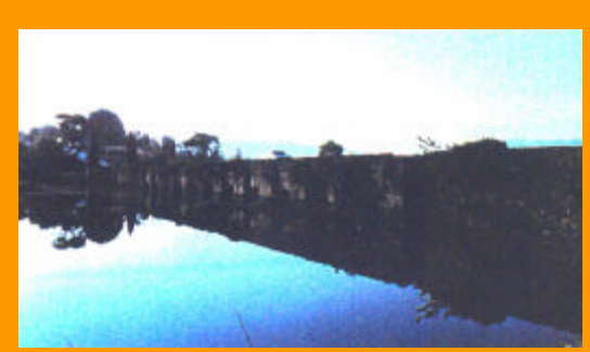
The bridge over the Puente Grande River in Mexico.

At the other end of the bridge, the monk placed a statue of himself. He told local people to kneel before his statue and pray to insure a safe trip across the bridge.